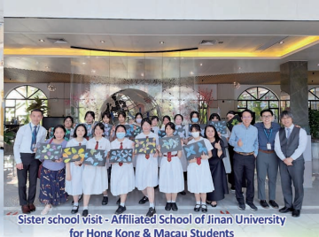
Sister school visit - Affiliated School of Jinan University for Hong Kong & Macao Students