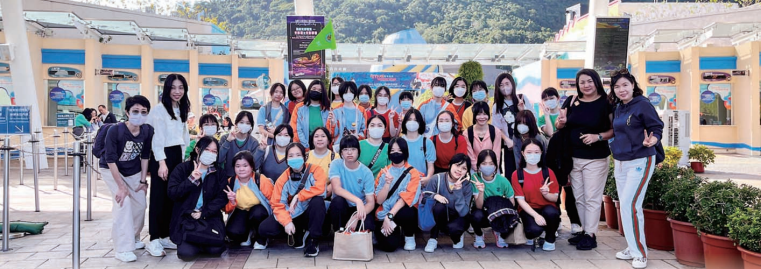
School picnic day at Ocean Park