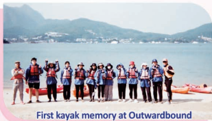
First kayak memory at Outwardbound

Our school provides more than 50 extra-curricular activities covering academic, interests, sports, art and religious areas in order to give our students the most comprehensive and the richest learning experience. We aim to extend classroom learning and let students have a balanced development of ability, knowledge, values and attitude, so as to realize our objective in education, i.e. education on spiritual, moral, intellectual, physical, social and aesthetic aspects. With a wide range of extra-curricular activities, students are able to grow and develop individual potential. Besides, students are strongly encouraged to take part in various social services, joint school activities and inter-school competitions.