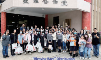
"Blessing Bags" Distribution