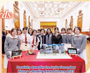
Creativity Award in the Junior Secondary History e-Reading Award Scheme 2023

We encourage students to express positive values, exemplified by historical figures and events, through various mediums beyond writing. Our students achieved success in the 13 th Inter-school Competition of Project Learning on Hong Kong's History and Culture, which was co-organized by the Hong Kong Museum of History and The Hong Kong Institute for Promotion of Chinese Culture. We are pleased to announce that we have won the 1 st Prize in the Junior Division (Multimedia Production) and the 4 th Prize in the Senior Division (Multimedia Production). Additionally, two student teams were both awarded the Creativity Award in the Junior Secondary History e-Reading Award Scheme 2023, which was jointly organized by the Education Bureau and the University of Hong Kong.