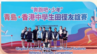
Qingdao and Hong Kong Middle School Students Athletics Friendly Competition