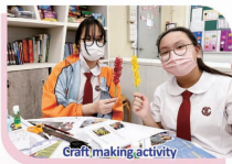
Craft making activity

and English broadcasts about SAGC news. Cross-curricular learning activities are also organized with other departments such as making paratha rolls and sticky rice puddings and playing sports games. In order to strengthen students' English, after-school tutorials are held such as Springboard Enrichment classes for gifted students and Remedial classes for less able and hardworking ones. All these activities are to stimulate students' interest in learning English and enhance their confidence in using the language.