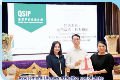
Assessment Literacy: Effective use of data; Alignment of teaching and assessment

Having rich teaching experiences, our teachers are patient and warm-hearted. Different teams cooperate on a regular basis for lesson preparations, peer observations and sharing among teachers and schools. Our school also organizes different kinds of courses, workshops and programmes for teachers both at school and outside the school to enable them to be familiar with the latest educational trends, classroom strategies and teaching effectiveness. Each year, there are at least three Staff Development Days for professional exchanges and collaboration.