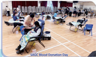
SAGC Blood Donation Day