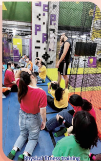
Physical fitness training

The Physical Education Department aims to develop our students' physical competence in order for them to build a lifelong active and healthy lifestyle. The department also cultivates students' generic skills, such as collaboration, communication, creativity, critical thinking and aesthetic appreciation. Teachers collaborate with different subject departments, professional bodies and organizations to provide various physical activity opportunities for our students and nurture positive values and attitudes. Students are also encouraged to do sports and exercise from school to home to increase physical activities and enhance their health.