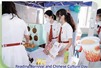
Reading Carnival and Chinese Culture Day