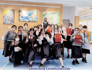
Celebrating Constitution Day