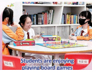
Students are enjoying playing board games