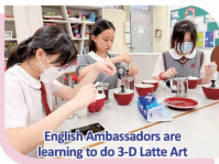
English Ambassadors are learning to do 3-D Latte Art