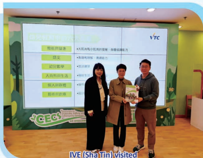
IVE (Sha Tin) visited