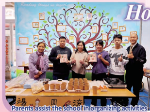
Parents assist the school in organizing activities

get along with their children and how to talk about life planning with their children. We organize a number of parent-child activities, such as volunteer services, parent-child tours, parent-child workshops and more. The PTA also actively participates in school events such as Aesthetic Night, Graduation Ceremony, and the IMC Meetings.