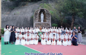
The Procession of Our Lady