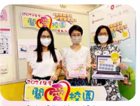
Caring School Award Scheme