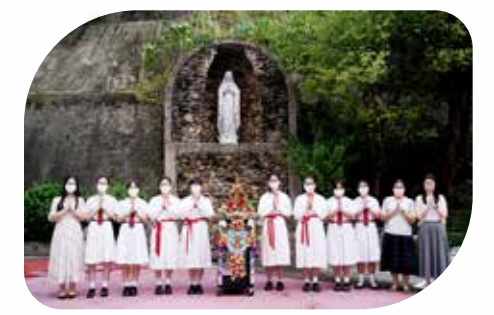
Procession of Our Lady