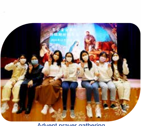
Advent prayer gathering