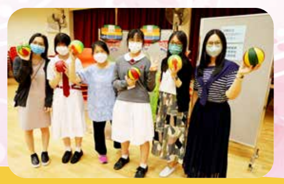
33 Social Inclusion Carnival.tif