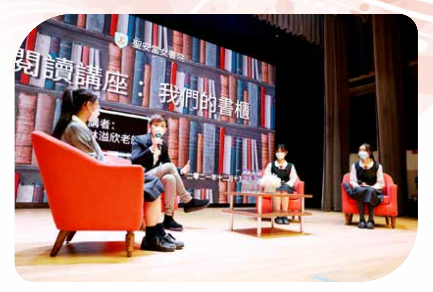
Sharing of reading experience by the Principal